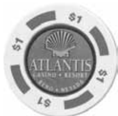
White 4 Blue Inserts Smooth Rim Surface

The resort currently boasts seven restaurants with seating for more than one thousand guests, Toucan Charlie's Buffet & Grille, Café Alfresco, The Purple Parrot, the Snack Bar & Soda Fountain and the acclaimed Atlantis Seafood Steak House, Oyster Bar on