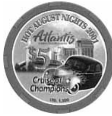
Hot August Nights 2001