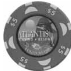
Red 8 Blue Inserts