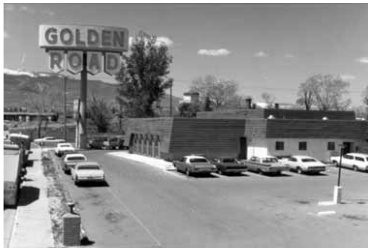
Golden Road Motor Inn

December 1992: The Clarion Hotel Casino opens the Atlantis Seafood Steakhouse and Nightclub.