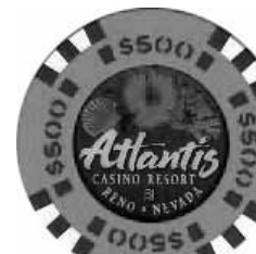
Hot Pink 12 Navy, 8 White

Current house chips. Chip scans courtesy of Larry Hollibaugh