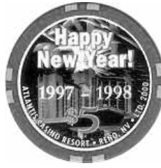
Happy New Year 1997 - 1998