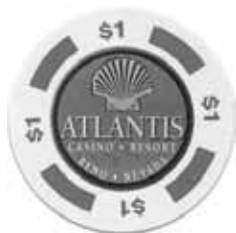
White 4 Blue Inserts 24 Lines Rim, BJ Mint Mark