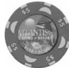
Red 8 Blue Inserts BJ Mint Mark