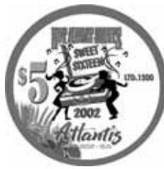
Hot August Nights 2002