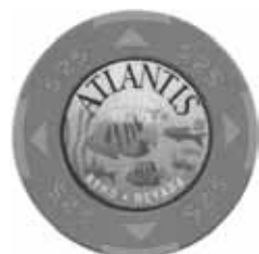
Green, 4 Orange Inserts BJ Mint Mark