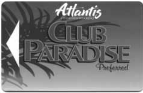
Current Slot Card