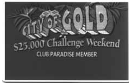
Special Slot Cards used for Tournament Play