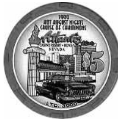
Hot August Nights 1999