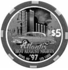
Hot August Nights 1997