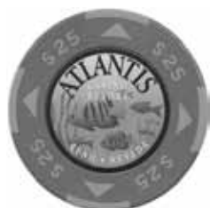
Green, 4 Orange Inserts