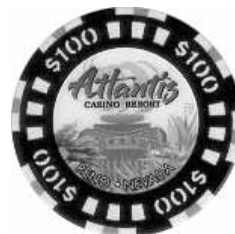
Black 16 Yellow, 8 Pink Inserts BJ Mint Mark