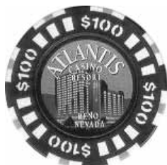
Black 16 Yellow, 8 Pink Inserts