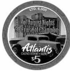
Hot August Nights 1998