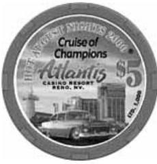
Hot August Nights 2000