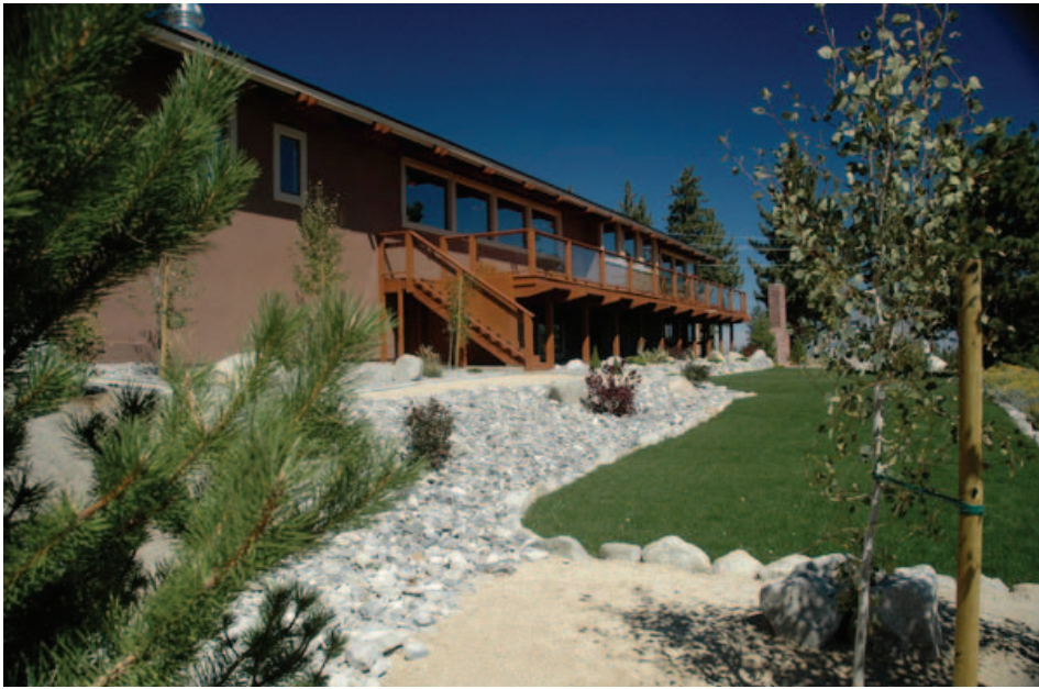
The back of The Tannenbaum showing the wedding or events area.

It was an undertaking that demanded substantial investment and work, producing a building (the Tannenbaum Alpine Events Center) that aspires to live up to its past. Visitors are greeted by an arching timber entryway that invites them to enter a facility in complete congruity with its surroundings. The stone lobby has been completely renovated and features an inviting lounge area in front of the original double-sided fireplace—the other side of the fireplace faces the banquet room. This original fireplace, along with its stone relief Christmas Tree, has been assiduously preserved and transformed from wood- to gas-burning. Central to the Nobis’ vision for the new premises is a great room that brings together the areas that used to constitute divided bar and restaurant spaces. With newly installed floor-to-ceiling windows, the large banquet