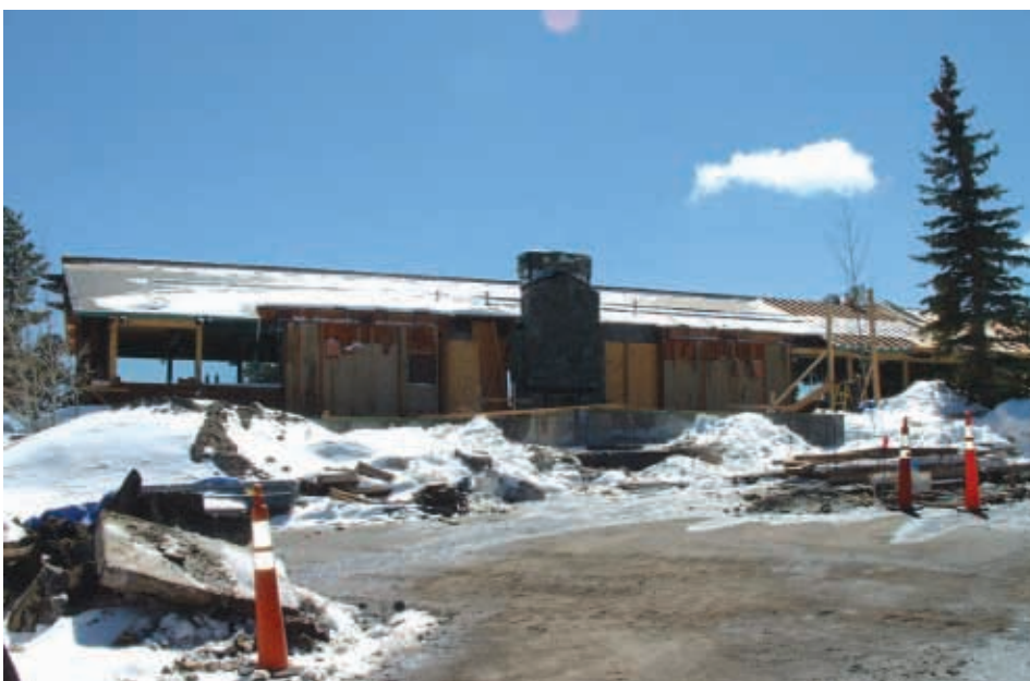
Construction on the Christmas Tree to produce The Tannenbaum.