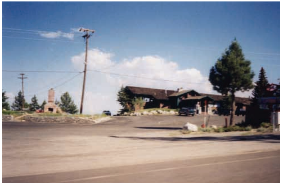
The fireplace from the original building sits to the left of the new structure built in 1965