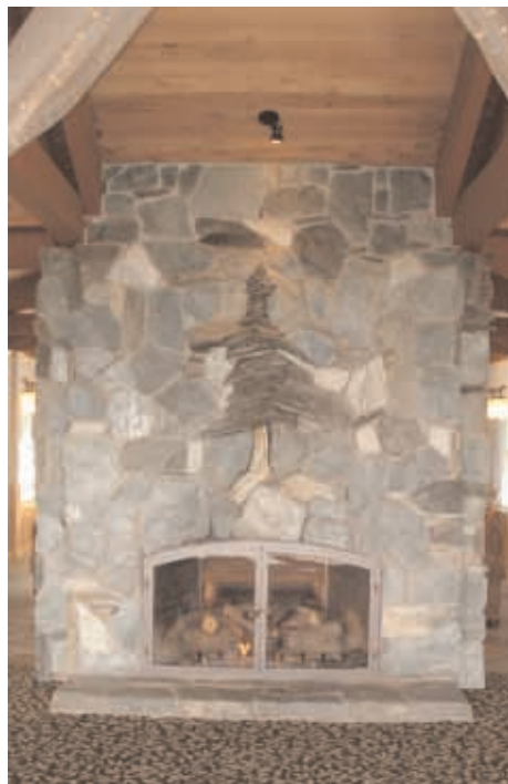
The fireplace from the original Christmas Tree still stands in The Tannenbaum. The wood burning fireplace has been replaced with gas.

It was an undertaking that demanded substantial investment and work, producing a building (the Tannenbaum Alpine Events Center) that aspires to live up to its past. Visitors are greeted by an arching timber entryway that invites them to enter a facility in complete congruity with its surroundings. The stone lobby has been completely renovated and features an inviting lounge area in front of the original double-sided fireplace—the other side of the fireplace faces the banquet room. This original fireplace, along with its stone relief Christmas Tree, has been assiduously preserved and transformed from wood- to gas-burning. Central to the Nobis’ vision for the new premises is a great room that brings together the areas that used to constitute divided bar and restaurant spaces. With newly installed floor-to-ceiling windows, the large banquet