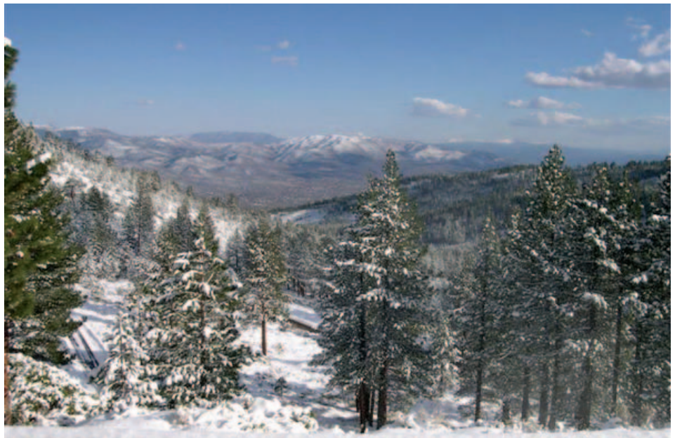
The view looking toward Washoe Valley.