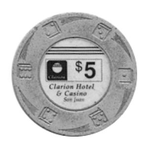
PUR – CLA - 5 SPD.1 NCV (Obverse side)

In Puerto Rico, in the Caribbean, the Speed Dice mold was used on a chip in the Clarion Hotel & Casino. This casino issued a $5.00 'No Cash Value', 'Non Refundable' chip.