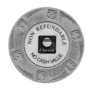
PUR – CLA – 5 SPD.1 NCV (Reverse side)

(SYMBOL KEY: 'PUR' stands for the Island of Puerto Rico, 'CLA' stands for Clarion Casino, '5' refers to the denomination. 'SPD' refers to the SPEED DICE MOLD, while '.1' refers to the first chip in a series. This classification is derived from Pollack's Reference Code System in Pollack's new book, 'The Casinos of Aruba, Bonaire, Curacao, St. Maarten & Suriname', Copyright 2000)