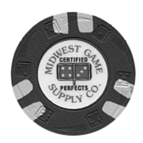
USA - MID - SPD .2

In my research and travels to St. Maarten, in the Caribbean, the Kalliste Casino, now defunct, had issued and used casino chips with the Speed Dice mold. These beautiful chips were used as 'credit' chips. The denominations of the Speed Dice chips were $5, $10, $25, $50, $100, $500, $1000, $10,000 and $100,000