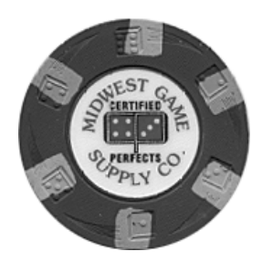
USA - MID - SPD .1

Two examples of the Midwest Game Supply sample chips are shown below: