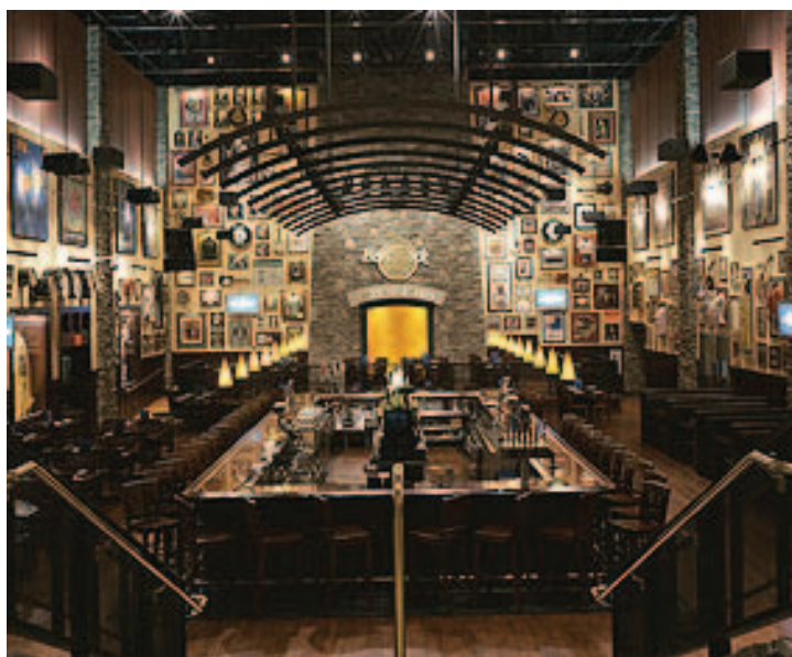
Hard Rock Cafe at Foxwoods

August 2004: The Hard Rock Cafe swings open its doors as part of a $99 million Rainmaker Casino expansion. In addition to 20,000 sq. ft. of gaming space that adds 750 new slots and additional table games, the expansion includes a seven-story, 2,100 space parking garage and the 3,700 sq. ft. Wampum Rewards Mega Store.