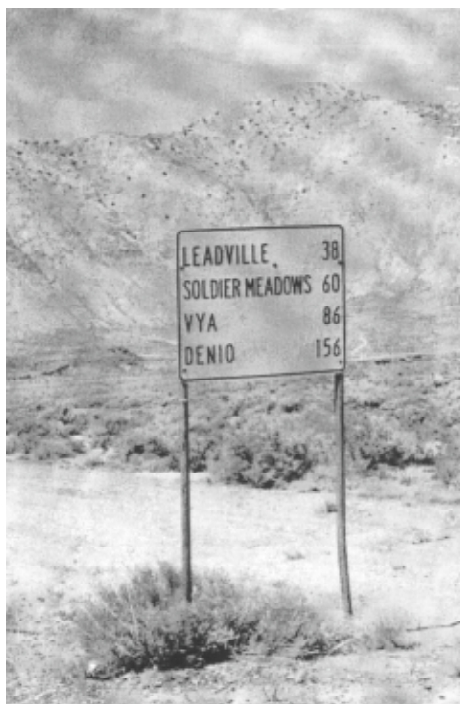
On leaving Gerlach to the North this sign reminds one that he is still in the middle of nowhere.

So, it was with great delight, when I returned to Gerlach this summer after an absence of some twenty years I found this not to be the case. Now, Gerlach is located a hundred and twenty miles north of Reno somewhere between the Black Rock desert and the twilight zone. It has gained some fame in recent years as host to the world land-speed record and the Burning Man Festival, a weeklong gathering of artists, hippies, and other "free spirits" which I surmise is another term for whack-o. Anyway, I was delighted to discover that Gerlach is stuck in a virtual time-warp. It was almost exactly as I remembered it thirty years ago.