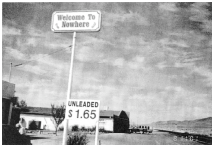
A sign at Empire, a few miles south of Gerlach, welcomes travelers to nowhere.