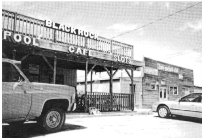
Thirty years later from the same angle

from 1957 to 1958. The Desert Club was in business from 1959 until 1971 which was about the time I photographed it. Apparently it remained closed for a number of years until it reopened as the Black Rock.