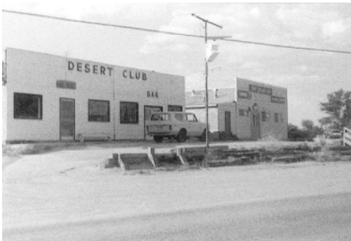
The Desert Club and Joe's Gerlach Club as they appeared about 1970.