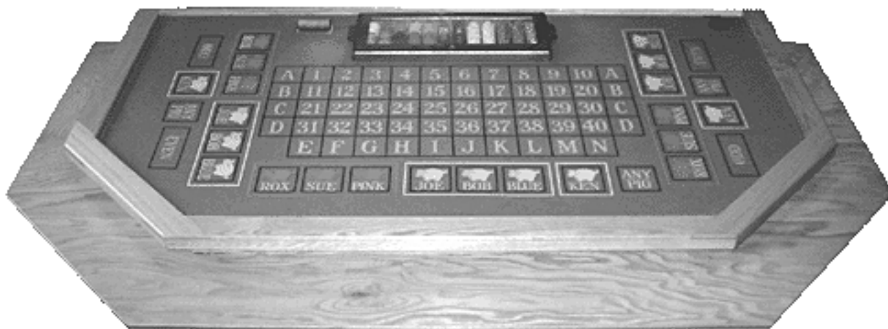
The Paddle – Pig Wheel Table Layout.

While a few other molds exist, including Hat and Cane, Elephant, and others, the current rate of return for chips found to date are mostly but not exclusively of the Bud Jones mold, with suite pips being the pre-dominate design.