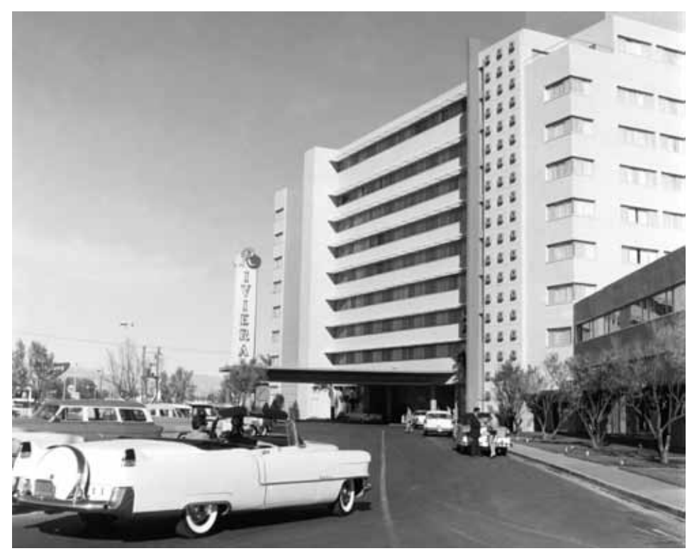
Las Vegas' first high rise, 1955