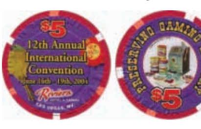
12th Annual CC&GTCC Convention $5 Year: 2004 Mintage: 1,000