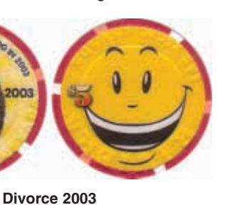
World Archery Festival and Vegas Shoot $5 Year: 2003 Mintage: 750