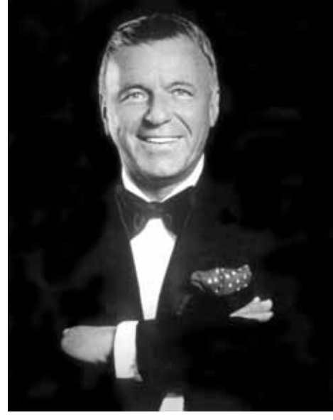
Frank Sinatra, 1991

It was formally announced that the Riviera was listed on the American Stock Exchange (RIV). Net income was increased by 30, to $2.47 million. Earnings per share improved from 40 to 49 cents compared to the first three months of 1995.