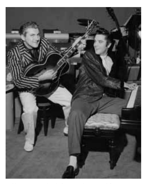
Liberace and Elvis Presley, 1956

Riviera presented a rare opportunity to win special hand-painted $10 tokens created and issued by Osbom Coinage, minted exclusively for the resort at their Millennium Countdown machines. These machines were located adjacent to the Splash Showroom. Every time a person won a payout of 60 coins or higher with maximum coins played, they got to choose one of the four specially designed collector's items. "No Nevada casino has ever issued a hand-painted token. This series is truly unique and once they