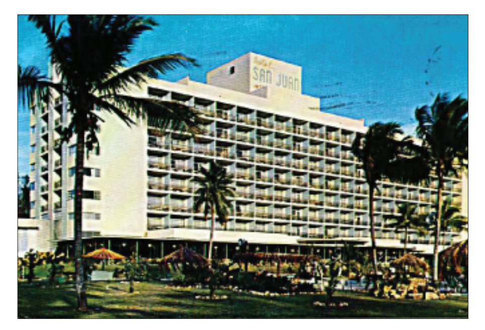
The El San Juan Hotel & Casino