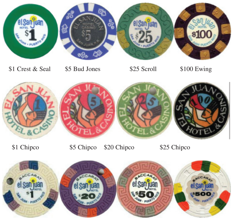
$1 Lgkey Baccarat $20 Lgkey Baccarat $50 Lgkey Bacarrat $500 H&C Baccarat

At 7012 Boca de Cangrejos Avenue in Isla Verde, the first casino to open was the Holiday Inn . The opening date is not known, but it did close in 1975.