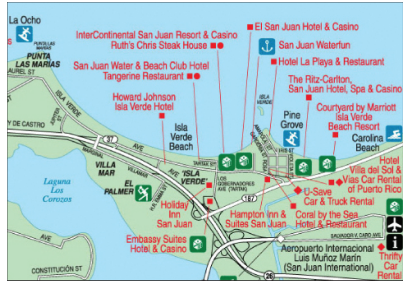
Isla Verde Beach tourist map

There currently are five casinos open on Isla Verde Beach: The Inter-Continental San Juan Resort and Casino, The Wyndham El San Juan Hotel and Casino, The Ritz-Carlton San Juan Hotel, Spa & Casino and the Casino del Sol which is in the Courtyard by Marriott Isla Verde Beach Resort, and the Embassy Suites Hotel & Casino, which is just off the beach. Some information about the history of these casinos and their chips follows.