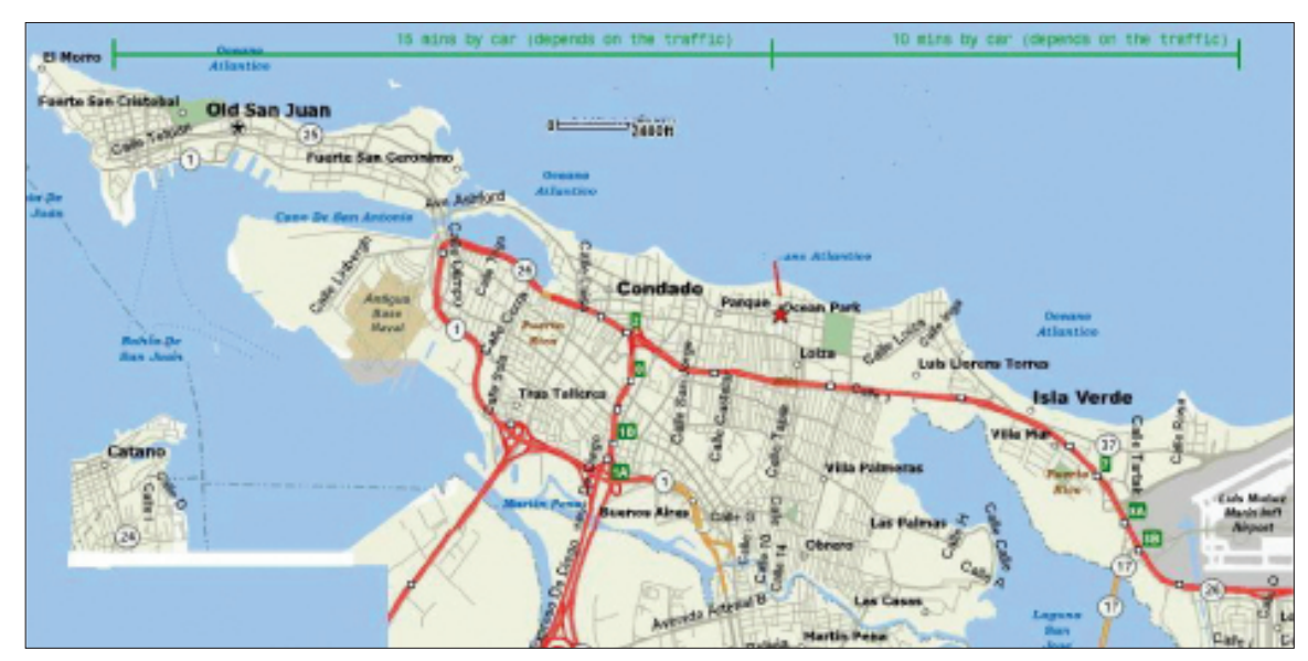
San Juan Metro Area, Puerto Rico

The year is 1948. World War II is over and the U.S. economy is booming. Vacation travel had been a luxury, but is now becoming affordable. All the conditions were right for Caribbean tourism to start taking off. At that time Havana, Cuba was the playground for wealthy Americans. But sharpies knew that the mob was running the casinos, the games weren't square and that government officials were being paid for their cooperation. Puerto Rico was anxious to get their fair share of American tourist dollars, but didn't want to invite in undesirable elements. In 1948, the Commonwealth of Puerto Rico legalized casino gaming and in 1949 the first hotel and casino opened, the Caribe Hilton.