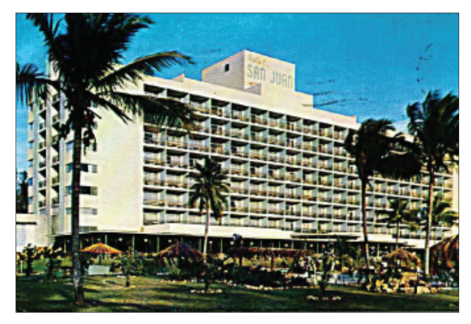
The San Juan Intercontinental

The postcards that follow are from the Intercontinental and the El San Juan and have almost the same view of the hotel from behind the pool.