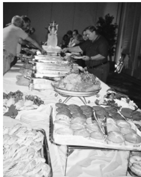
Brunch spread at the Flamingo

There will be a more in-depth report on the tournament in our newsletter.