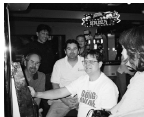
Playing for a silver strike