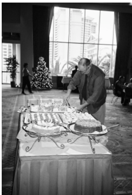
Desserts from the Sunday brunch