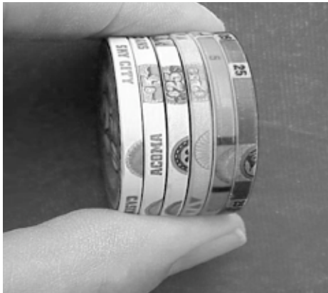
Original chips (Left) & replacement chips (Right)

b. Three stacked $2.50 chips will show a picture of the “$2.50” chip on the side