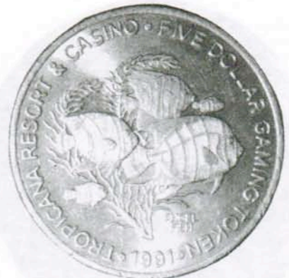
Photo #14 has a Sand Dollar; and finally photo #15, (which is the reverse of a cruise ship token) I ask, "how's that for wildlife?"