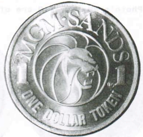
Photo #1 is the MGM Sands Lion. I wonder if this lion logo has ever been entered in any design contest? It would surely get my vote.

BC (Before Chipco) chips were just chips. The one dollar was what ever color the casino wanted. The five dollar chip was red in all joints. The $25 chip was green. No pictures, just names, colors and numbers. Tokens however, for the most part, have some very neat pictures. This issue, for your enjoyment I hope, I will present to you several tokens with wildlife as the theme.