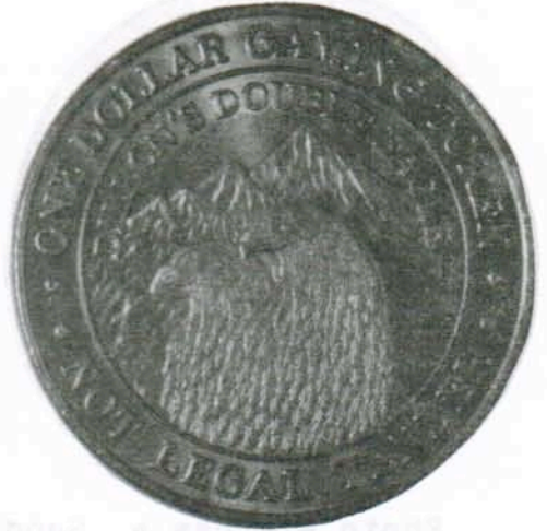
Photo #6 is of a sea gull. How could we ever leave out #7, the Flamingo? If we were voting for a sign on the strip, I would vote for the Flamingo. (Ed: Does the above sound like Andy Rooney?)