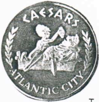
T CAE 5