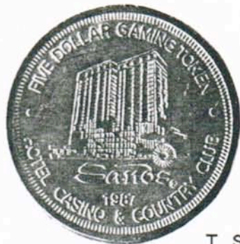
T SAN 5