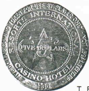
T RES 5