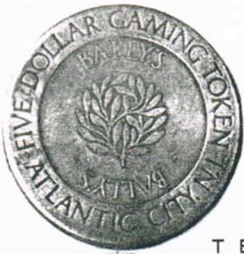
T BAL 5

As with other things in this world there are always exceptions..... as you will see with the examples cited. The illustrations on the left I've designated as obverses. Similarly, the illustrations on the right are the reverses. For the record, the first $5 token to appear in Atlantic City was issued by Harrah's Marina, the last, or most recent, was issued by Golden Nugget.....even though the G.N. issue bears the date 1986. The Golden Nugget $5 token was not put into play until the first week of