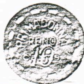
PRIMADONNA RENO 10 CENTS