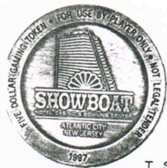
T SHO 5