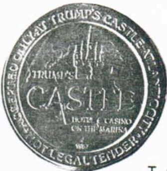
T CAS 5