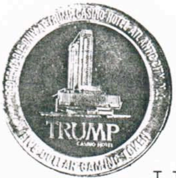
T TRU 5